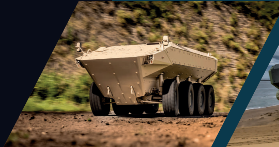
LAND ARMoured VEHICLES

This wide range represents a well thought-out, comprehensive and effective response to the needs of military , security and civil protection Customers.