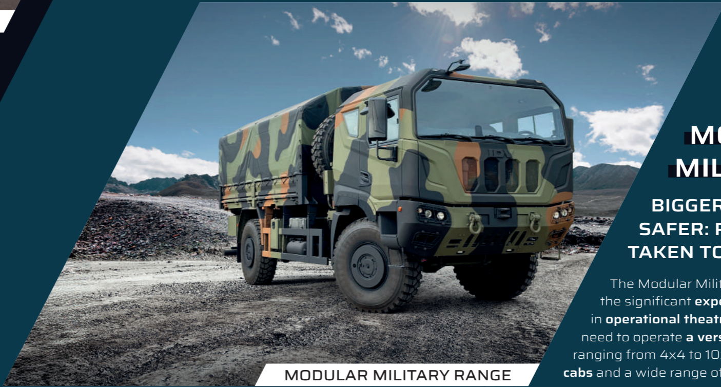
MODULAR MILITARY RANGE