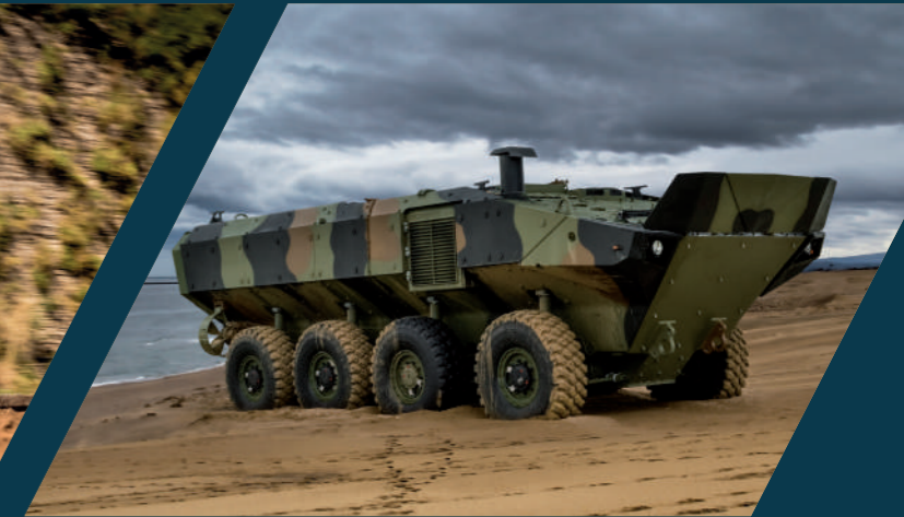
AMPHIBIOUS ARMoured VEHICLES