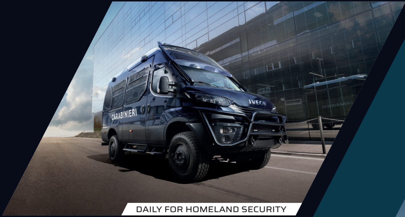
DAILY FOR HOMELAND SECURITY