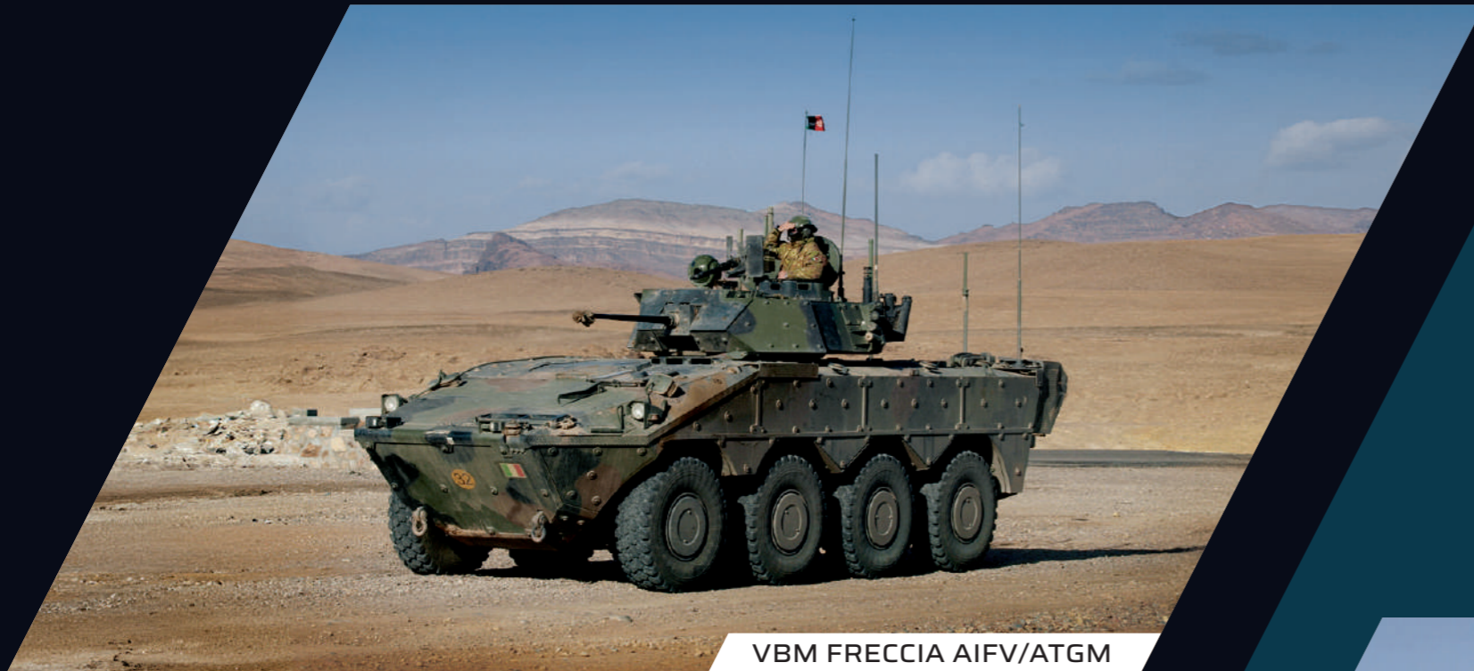
VBM FRECCIA AIFV/ATGM