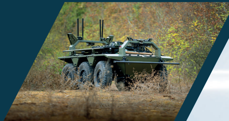
UNCREWED GROUND VEHICLES