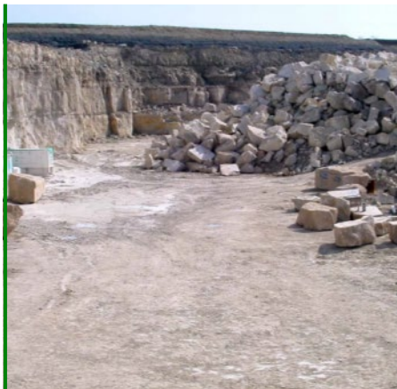
Mining & Quarry